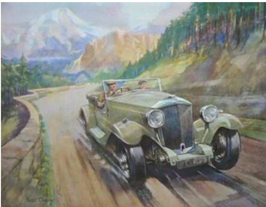
Illustration from a Railton brochure