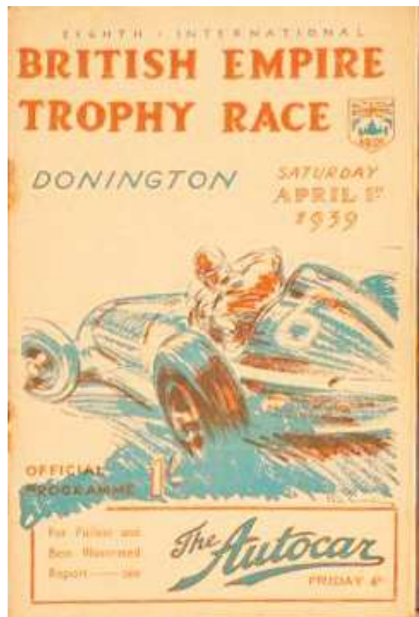
Donington programme 1939