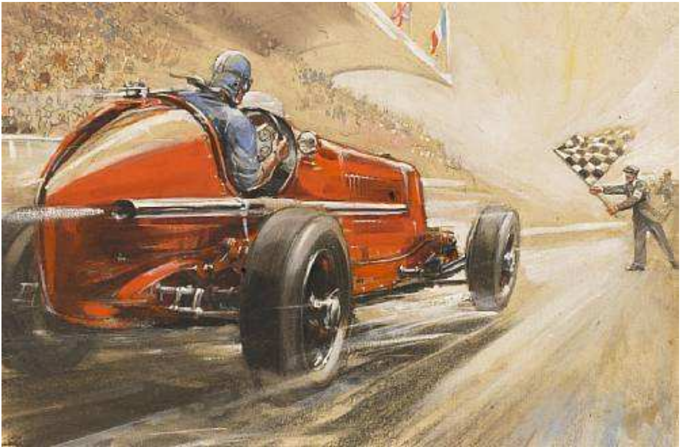
Artwork for front of 1938 Castrol Achievements