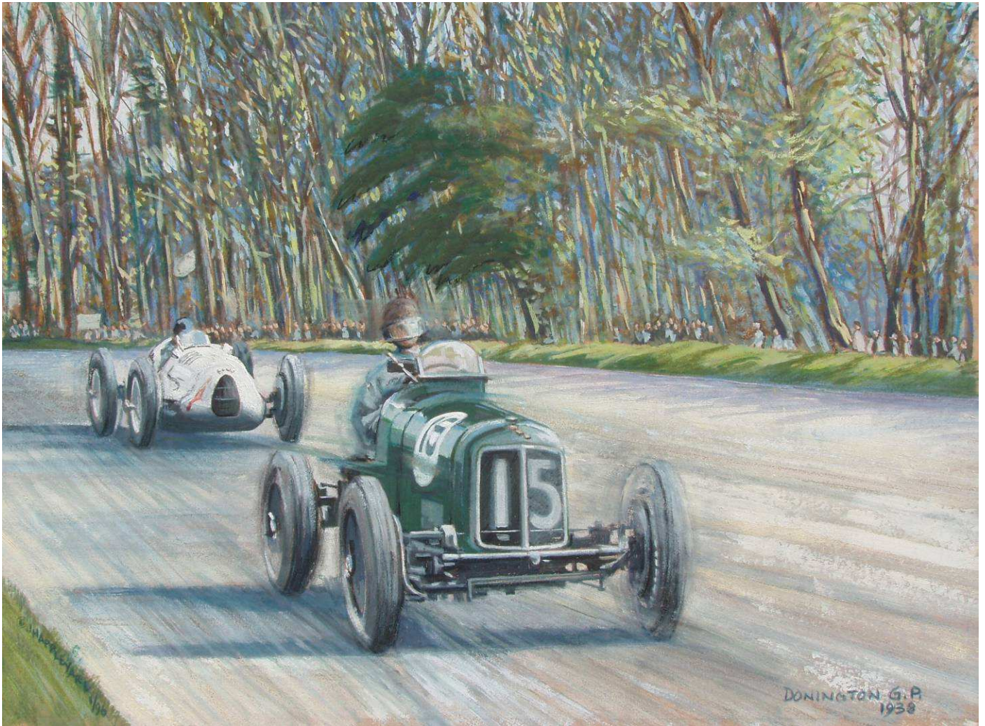
ERA and Auto Union at Donington 1938