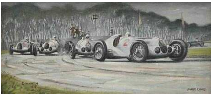
Trio of Mercedes at Donington 1937

Born in Leeds Yorkshire, where he also attended schooling and training at Leeds College of Art. Decided to follow a career in Art teaching and graduated from Leeds Training College. Taught Art at Yarm Grammar School, St Mary's College Middlesbrough and was Head of Arts at Darlington